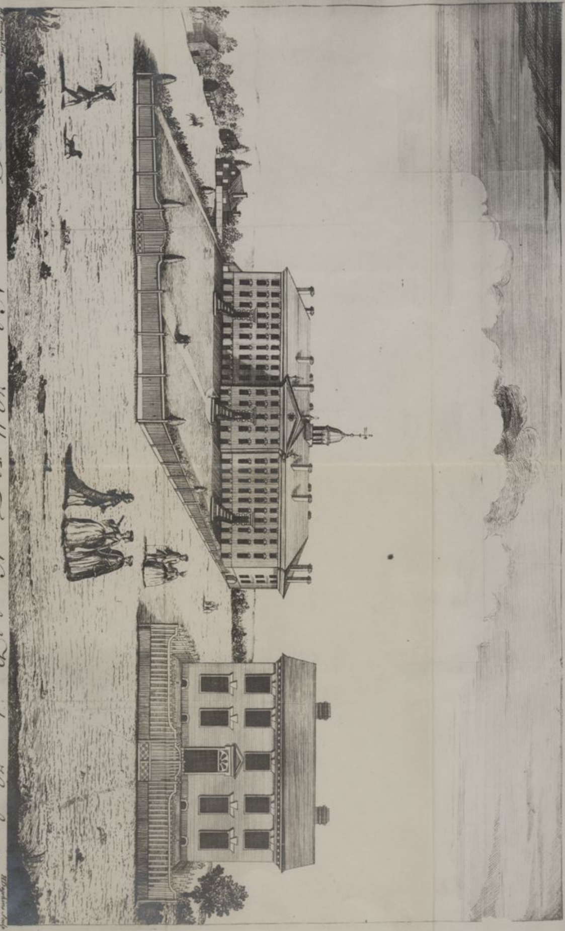
A North-West Prospect of Nassau Hall, with a Front View of the Presidents House in New-York.