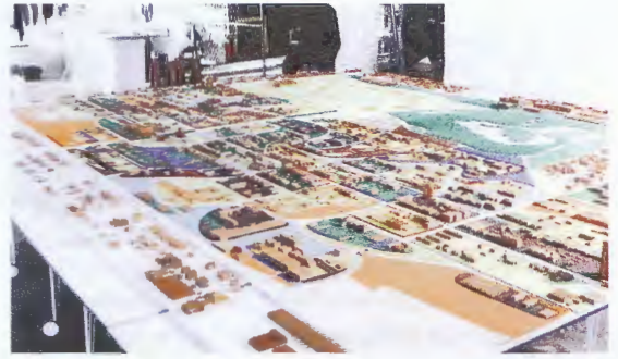
"Smooth Growth Model" detail, mixed media.

We call it Territory. We call it Land. We call it— The New Country.