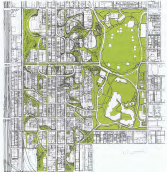
"Smooth Growth Plan for Washington Park, Chicago", digital graphic.