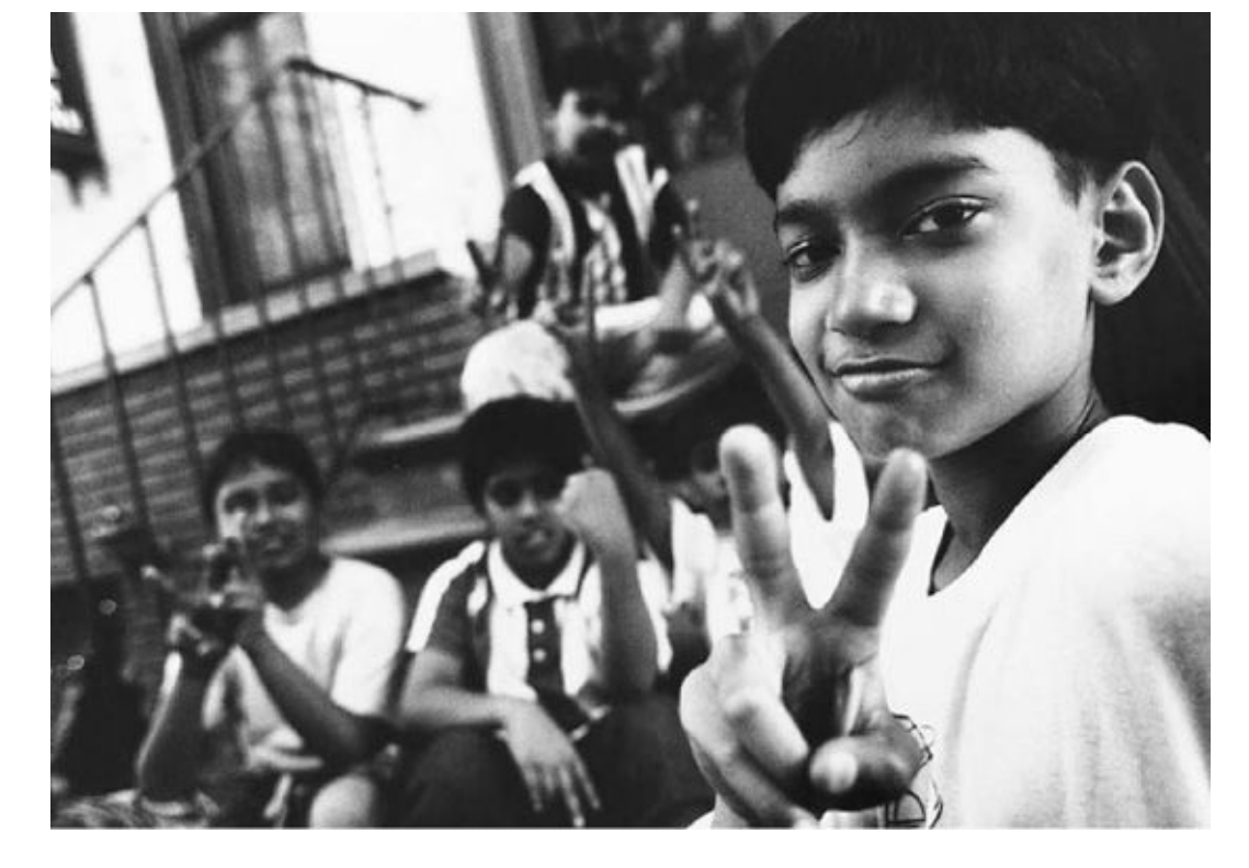
"We are the bangla niggers," New York City (1997).