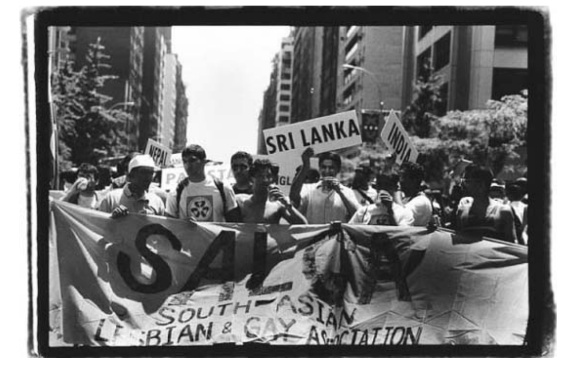
SALGA at India Day parade (1997).