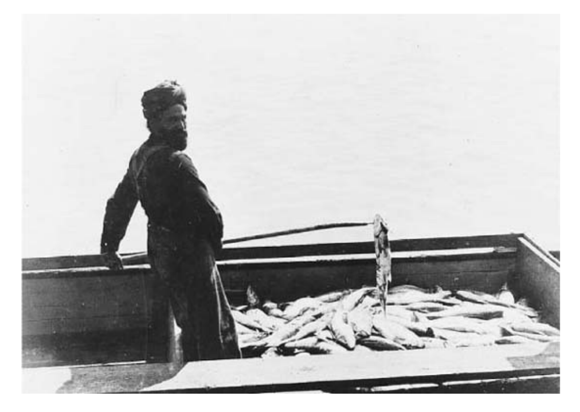
A working-class Sikh, an "unmodel minority," British Columbia, Canada (early 1900s).

simultaneously degrading "blacks" to the bottom of the pile.<sup>10</sup> The idea that "white" is supreme was consolidated, new historical work shows, in the early eighteenth century through a complex set of forces, mostly centered around issues of land (as the main source of wealth) and imported labor (in the main, from Ireland and Africa).<sup>11</sup> "Black," as culturally lesser, was forged in the smithy of agrarian relations; white supremacy treated black people as chattel, with little consideration for their cultural sentiments and political desires. The U.S. state created legal and punitive mechanisms to keep blacks at the bottom of the totem pole. It also relied upon competition from white workers and upon their disdain for blacks.