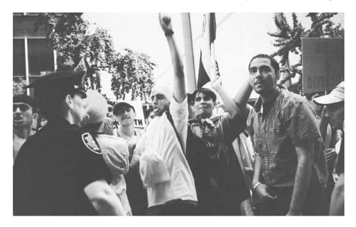
VHPA activists attack Youth Solidarity summer participants, India Day parade (1998).