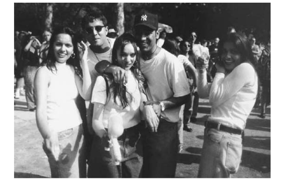
Five young people in New York City (1997).

Though inner-city South Asian, Caribbean, and white Britons forge cultures to combat the disenfranchisement of their localities, they also create ethno-racial subcultures that both enrich their lives and pit them against each other. When the South Asian American music scene exploded in 1996, the first observers noted that "the only black people [at the parties] are security guards."<sup>68</sup> In an astute analysis, Sunaina Maira showed how the adoption of black styles by young desi youth is less part of a rebellion against the structures of power and more, perhaps, a generational stance against their parents. One young woman told Maira that blackness was a short-term fashion that would be shed once the young desi walked into the arms of corporate life. But even at the parties, Maira noted, the adoption of "bhangra moves" allowed the desi youth "to assert their ethnic identity" and distinguish themselves from blacks.<sup>69</sup>