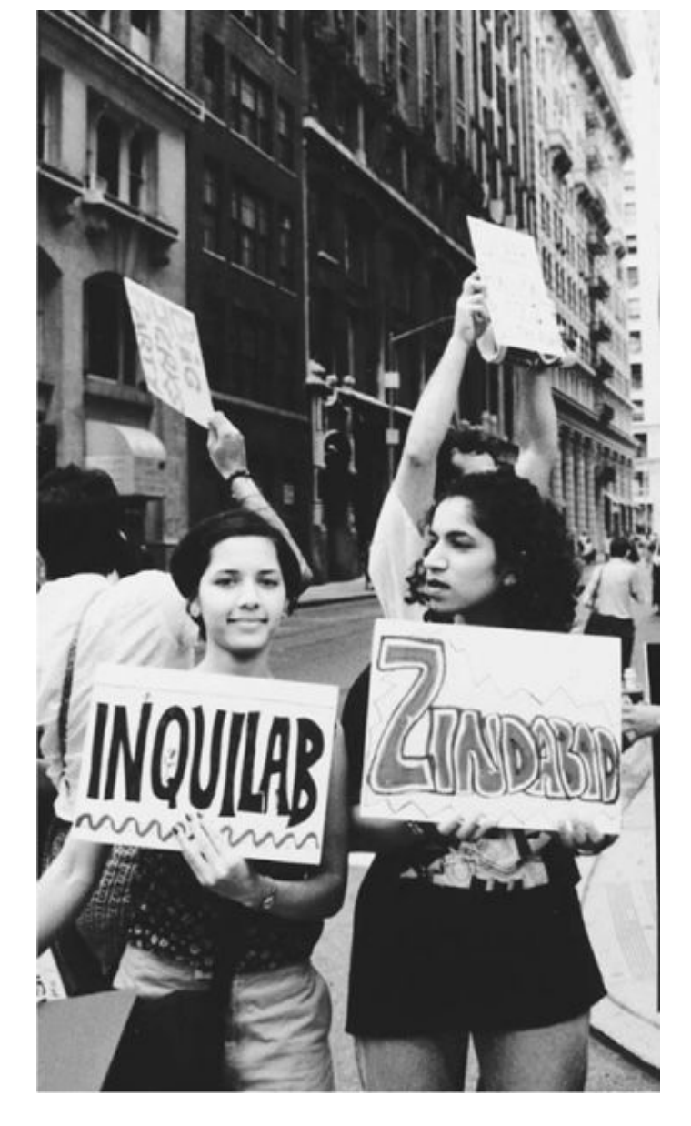
India Day parade, New York City (1998).