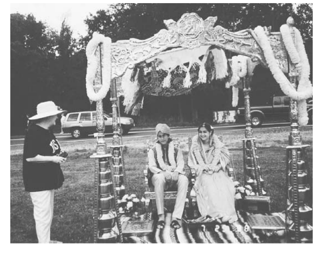
Pageant of an Indian Wedding, Rockland County, New York (1998).