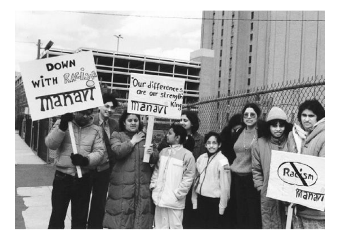
Manavi demonstration, New Jersey (1980s).