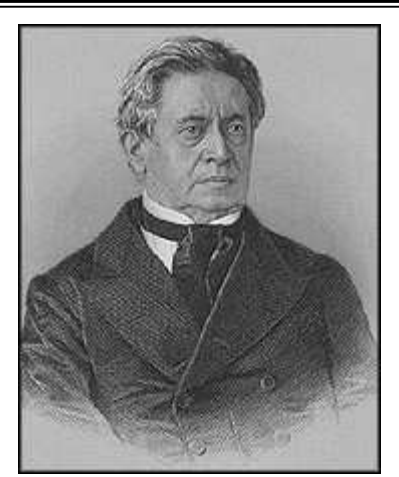
Henry, ca. 1875.

"I cannot tell you how much these two words have encouraged me," he told his parents. "I live too much in an atmosphere of discouragement for scientific pursuits.... Such a chimerical idea as telegraphing vocal sounds would indeed to most minds seem scarcely feasible enough to spend time in working over. I believe, however, that it is feasible, and that I have got the cue [sic] to the solution of the problem."