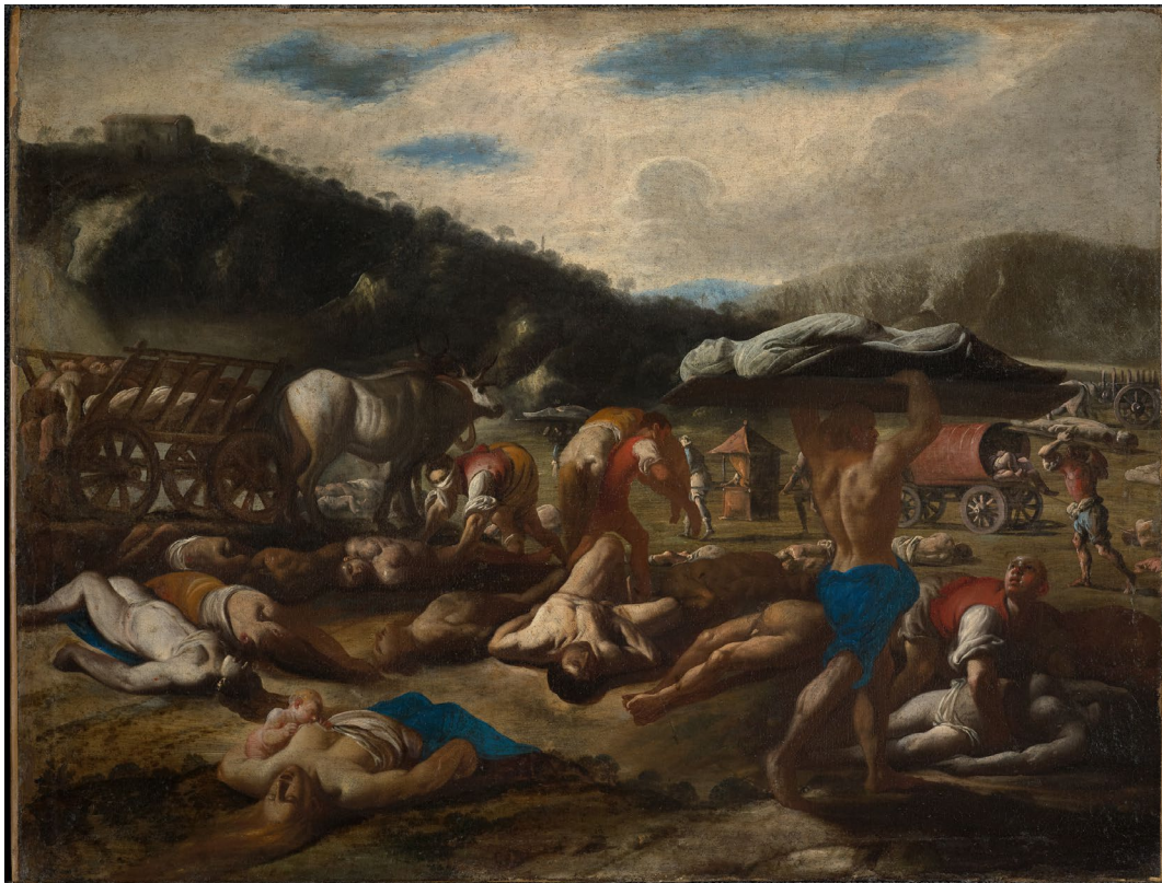
Carlo Coppola, Italian, active ca. 1635–1672 The Pestilence of 1656 Oil on canvas 76 x 99 cm (29 15/16 x 39 in.) frame: 98 x 119 x 4 cm (38 9/16 x 46 7/8 x 1 9/16 in.)

Museum purchase, Caroline G. Mather Fund y1963-36