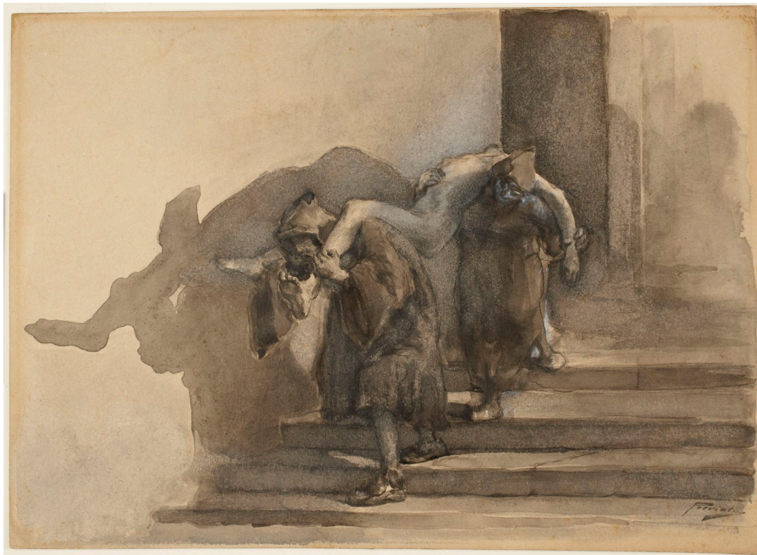
Gaetano Previati, Italian, 1852–1920 The Monatti, illustration to Alessandro Manzoni's I Promessi Sposi ca. 1895–99 Watercolor, heightened with white gouache, on light brown wove paper 23.2 x 32.2 cm (9 1/8 x 12 11/16 in.) frame: 41.6 x 54.3 x 2.9 cm (16 3/8 x 21 3/8 x 1 1/8 in.)

Museum purchase, Felton Gibbons Fund 2007-16