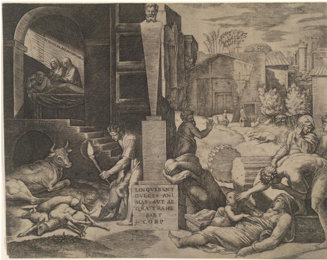
Marcantonio Raimondi, The Plague (Il Morbetto) , engraving after Raphael, ca. 1515-1516