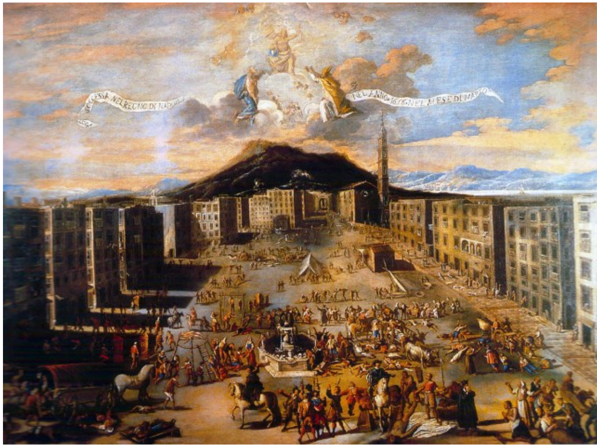
Carlo Coppola, Piazza del Mercato during the Plague of 1656 , ca. 1660, Museo di Sant Martino, Naples