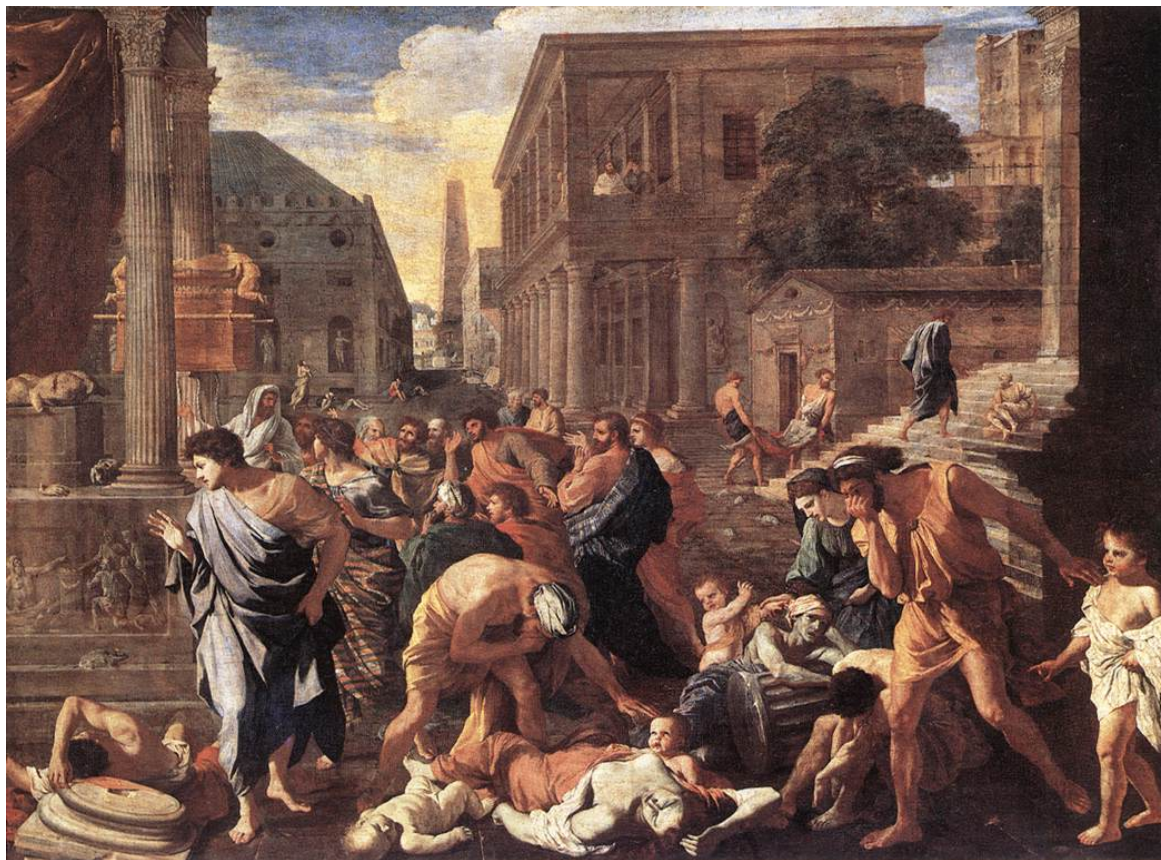
Nicolas Poussin, The Plague at Ashdod , ca. 1630, oil on canvas, Louvre